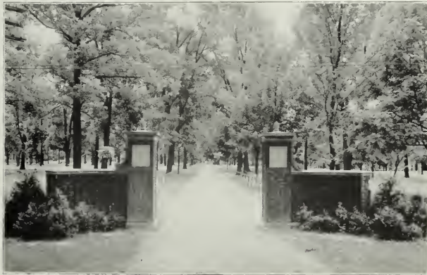
THE DIAGONAL WALK